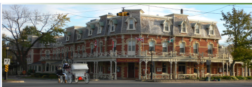
QUAINT HISTORIC TOWNS & ATTRACTIONS