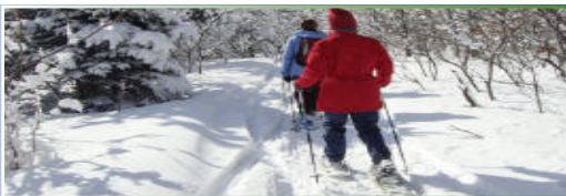
YEAR-ROUND OUTDOOR ADVENTURES