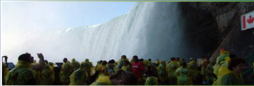
WORLD FAMOUS HORSESHOE FALLS